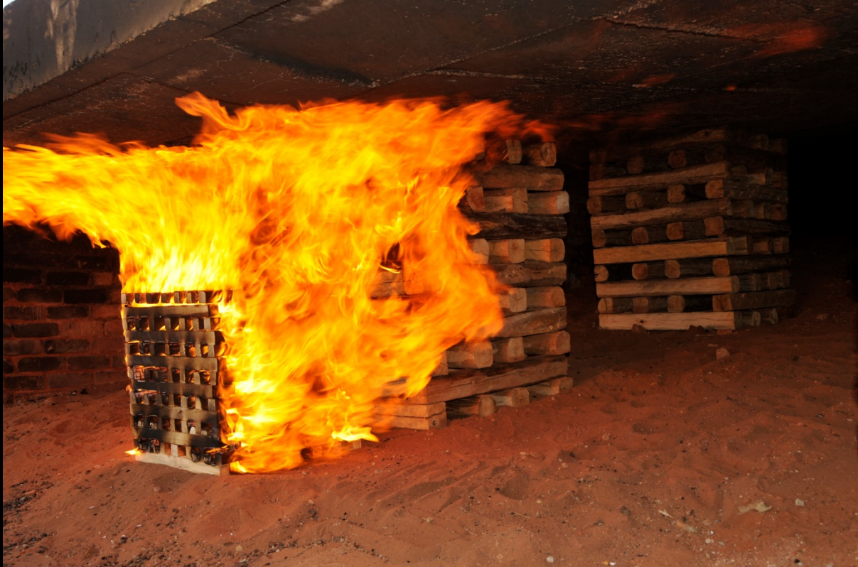
Stope test on Timber Mine Supports